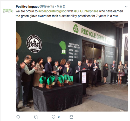
Congratulations to our partners @SFGEnterprises for winning the 'Green Glove' award for 7 years running! If you're out and spot something sustainable, share it using #CollaborateForGood

The United Nations Sustainable Development Goal 5 believes that gender equality aims to ensure gender equality is not only a fundamental human right, but a necessary foundation for a peaceful, prosperous, and sustainable world.